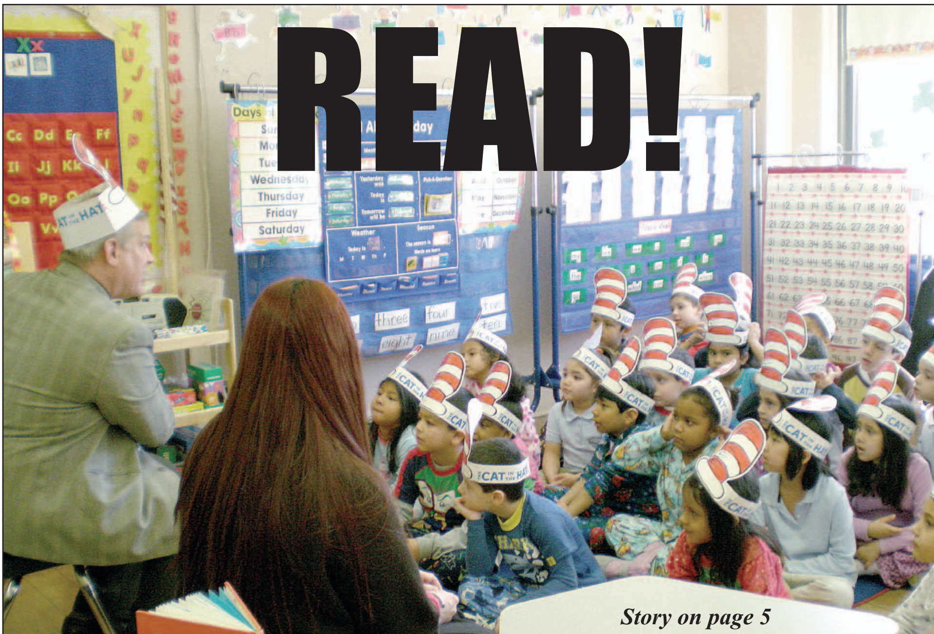
Story on page 5